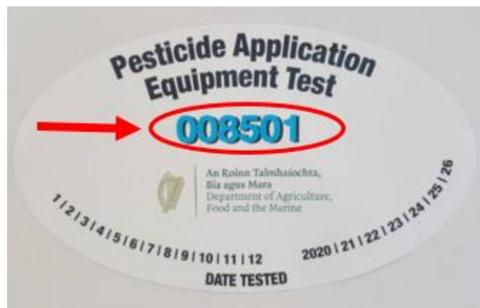
Figure 2. PAE Test Number.